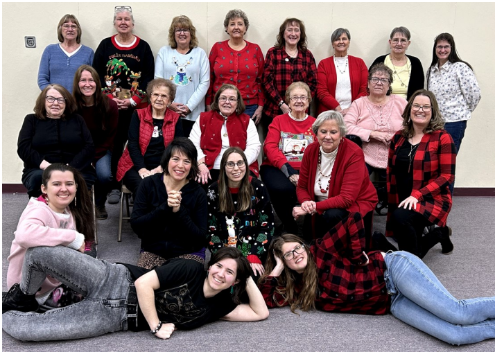
The Ladies' Christmas Brunch and white elephant gift exchange was well-attended on December 7 by the group above. If you haven't attended one of these events be sure to join in the next time.