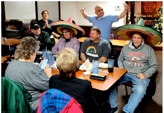
Celebrating recent December birthdays at our Food and Fellowship at La Fuente. Join us Thursday nights at 6:00 PM.