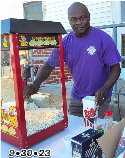
Pictures from the Good Neighbor Fun Day on September 30. There was a turnout of around 125. Many were not regular attendees. We plan to make this an annual event.